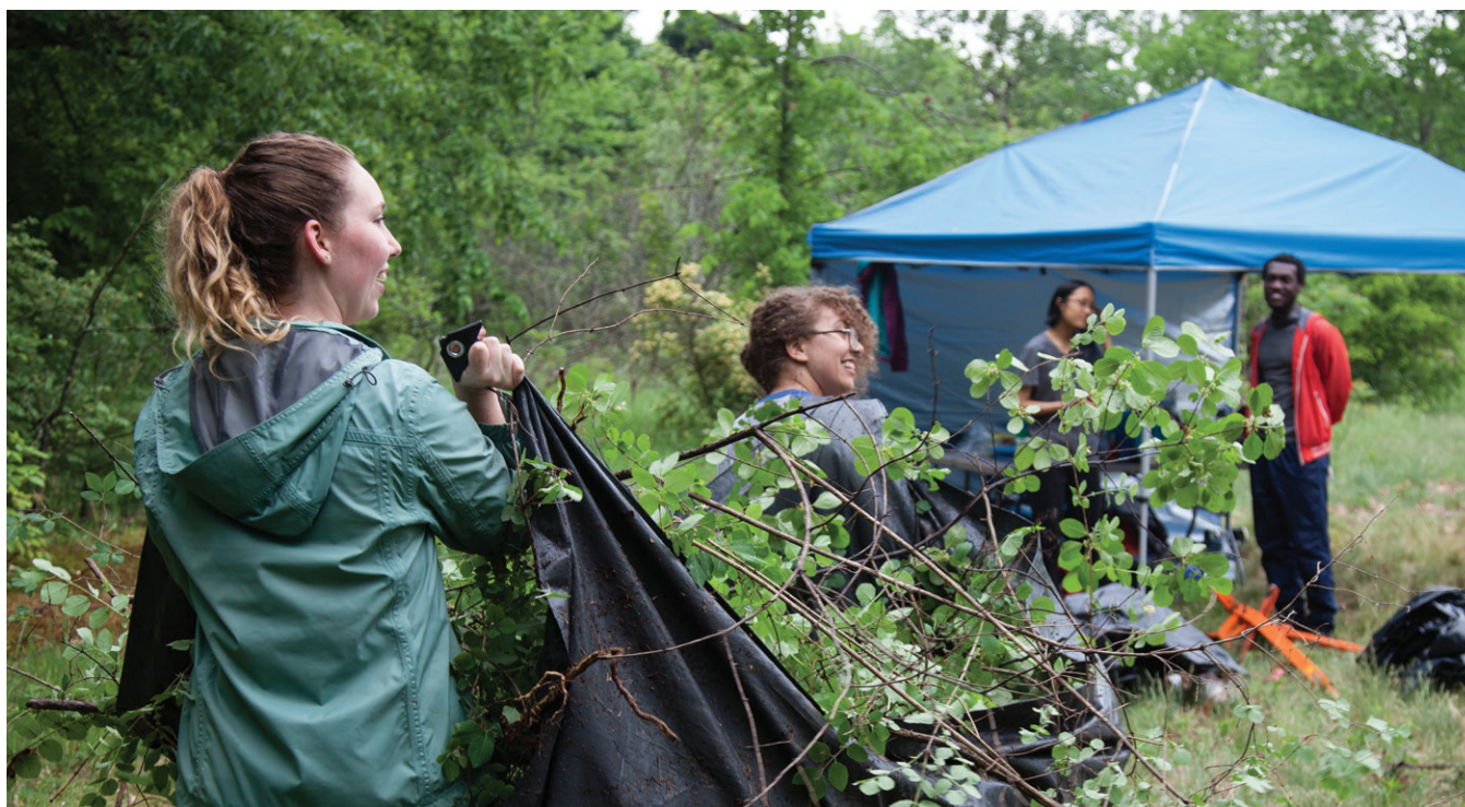
Volunteers removing invasive species at Mud Lake

ecological integrity and biodiversity in the park; the Greenbelt Master Plan aims to protect the natural systems of the Greenbelt; and the Capital Urban Lands Plan aims to protect valued natural habitats and regional biodiversity on urban lands and reinforce urban vegetation cover. Some NCC programs and operational activities that are aimed at preserving biodiversity and reducing habitat fragmentation include the implementation of species at risk recovery plans, the Responsible Trail Management Program, the Natural Resources Action Plan, the protection of ecological corridors, invasive species management and shoreline restoration projects. Actions under this strategy will focus on measuring the NCC’s progress towards protecting ecological corridors adjacent to Gatineau Park and addressing the impacts of exotic, invasive species on NCC lands.