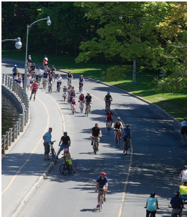
Colonel By Drive

Investing in the long-term sustainability of cities and the well-being of local communities requires the consideration of multiple intersecting factors, including access to affordable housing, public transportation and green spaces, as well as preserving built, cultural and natural heritage. As steward of natural and cultural heritage and long-term planner for the region, the NCC works to cultivate an environment that favors the well-being of Canadians and provides a vision for sustainability in the region. As such, the NCC is committed to the improvement of infrastructure, such as transportation systems and affordable housing and the development and enhancement of accessible green spaces for a more sustainable and liveable National Capital Region.