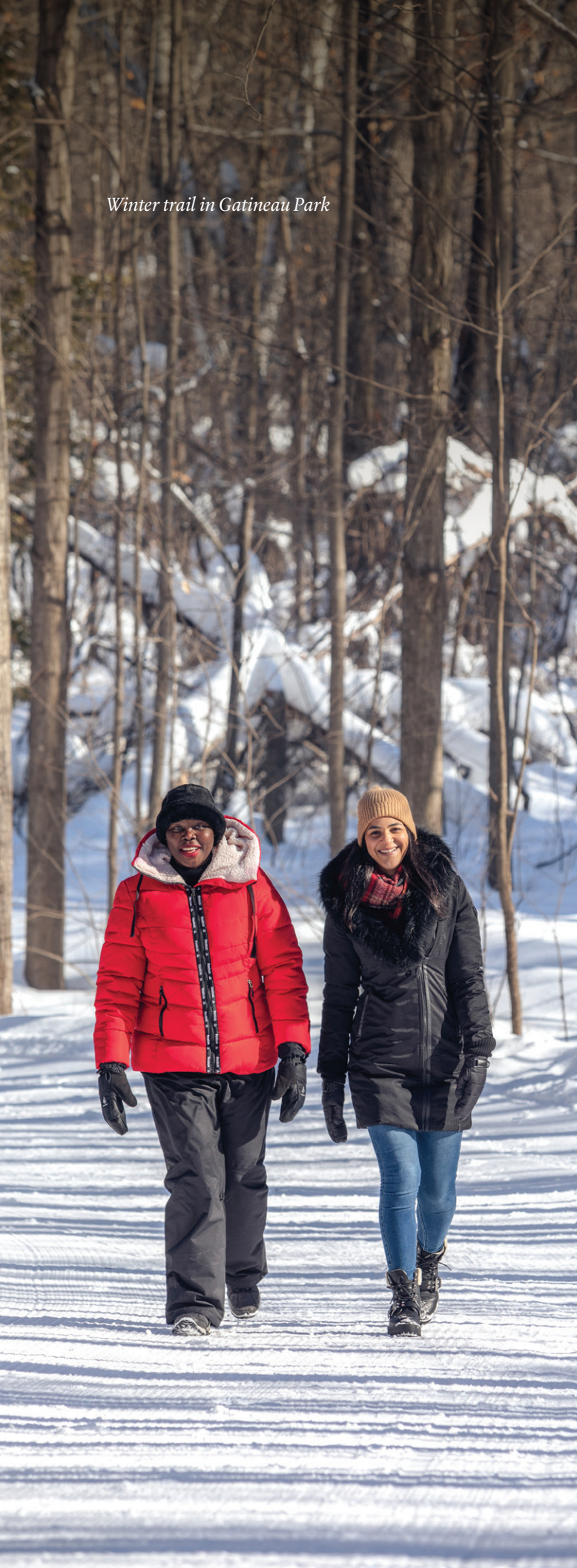
Winter trail in Gatineau Park