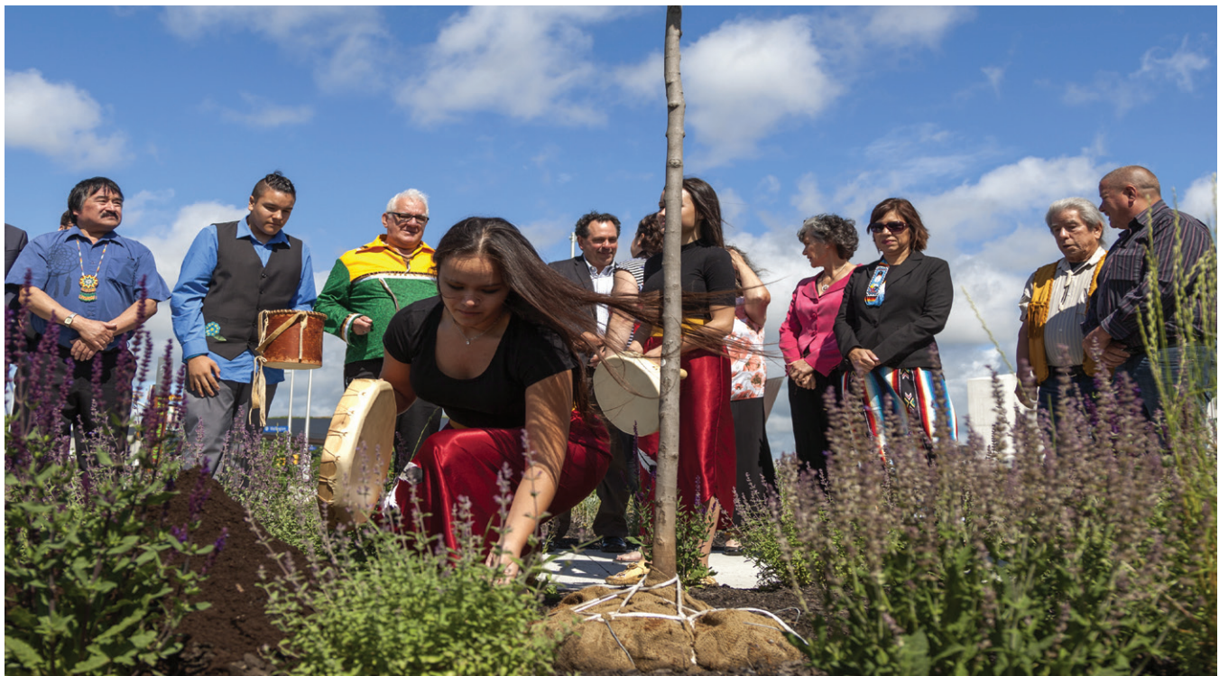
Opening ceremony at Pindigen Park

collaboration, it can ensure that Indigenous perspectives are truly reflected in the numerous projects and proactive initiatives being undertaken across the National Capital Region. Over the period of this strategy, the NCC will continue to work towards reconciliation through its toponymy policy, which provides for a transparent decision-making process for naming and renaming NCC-managed assets, and the Advisory Committee on Toponymy, which includes partners from Kitigan Zibi Anishinabeg and Algonquins of Pikwakanagan First Nation, as well as experts in local and national history. The NCC will also continue to build relationships through projects that are specifically aimed at advancing reconciliation, such as the Anishinàbe Objibikan Archeological Field School and through important Capital-building projects, such as the redevelopment of Kiweki Point (formerly Nepean Point) and the rehabilitation of Victoria Island.