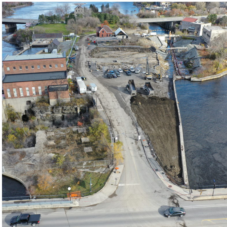
A site remediation project at Victoria Island

Since 2018, the NCC has been working towards reducing waste from its most significant operations, including office waste, demolition waste and public waste associated with key sites, events and programs. Due to the implementation of a waste triage program on the Rideau Canal Skateway, public waste diversion rates were increased by 80%. Under this strategy, the NCC will continue its efforts to reduce waste in these areas, implement measures to reduce construction waste, and identify opportunities for waste reduction at new sites, events or programs.