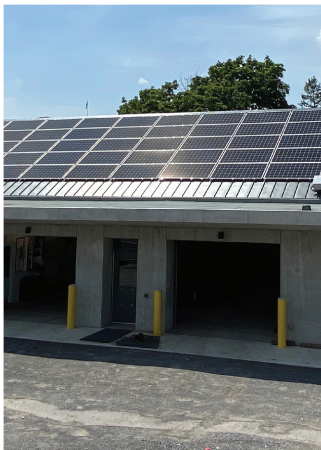
“The Barn,” a new certified zero-carbon service building at Rideau Hall

To green its overall operations, the NCC will also focus on implementing measures in its most significant areas of operation, where it can have the most environmental impact. This includes ensuring that NCC green spaces can continue to provide valuable ecosystem services and better managing forested lands, working toward low-carbon and environmentally sensitive land maintenance operations, reducing bird-window collisions in its vast portfolio of buildings, and encouraging the use of sustainable modes of transportation for staff commuting.